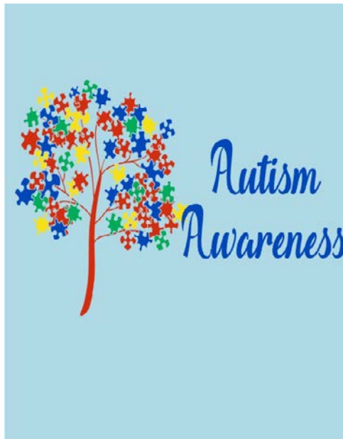
Front Left Chest